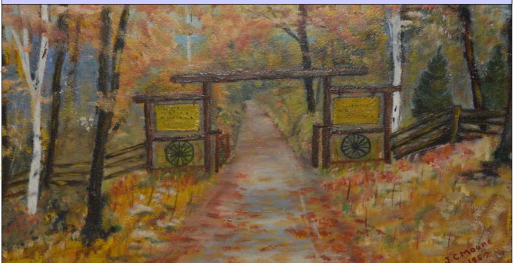
The HSR Alumni Thunderbird: HSR Staff Alumni Website: